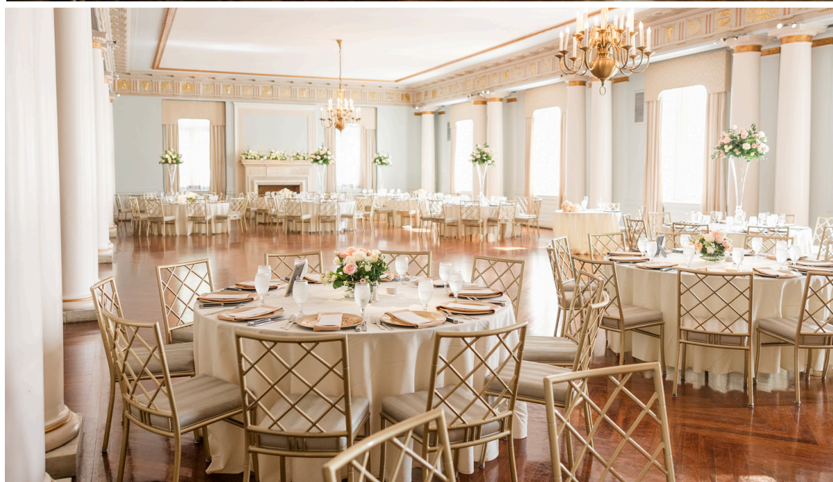
Pompadour Ballroom Up to 175 guests